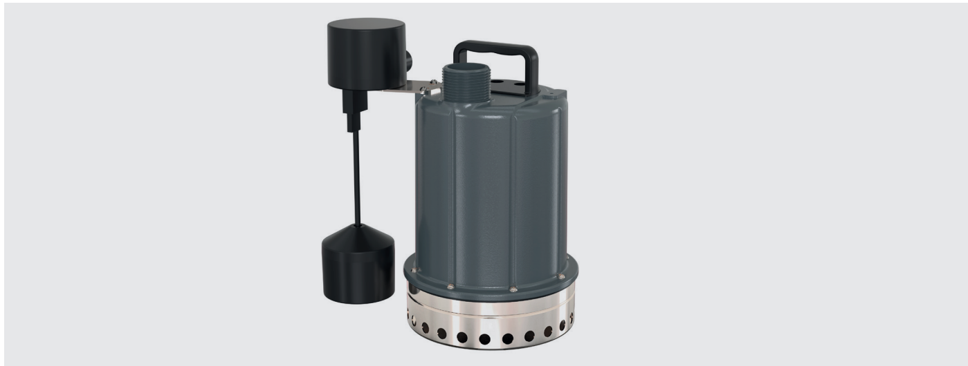
Elettropompe sommergibili con galleggiante verticale Submersible electric pumps with vertical float